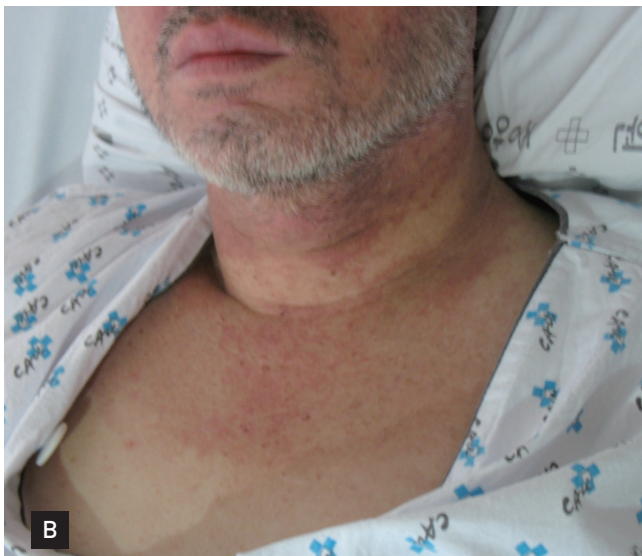
Figure 1. Skin manifestations of a 55-year-old man with dermatomyositis. (A) Characteristic purplish heliotrope rash over the upper eyelids. (B) 'V'-shaped purplish rash on the neck.

revealed the following: white blood cells 9,720/mm³, hemoglobin 13.6 g/dL, platelets 98,000/mm³, creatine kinase 16,440 IU/L (normal range, 0 to 190), lactate dehydrogenase 994 IU/L, aspartate aminotransferase 717 IU/L, alanine transaminase 139 IU/L, total bilirubin 1.4 mg/dL, albumin 2.2 g/dL, alkaline phosphatase 119 IU/L, and prothrombin time (activity) 55%. HBV surface antigen was detected, and the HBV DNA level was 7,380 IU/mL. No antibodies against hepatitis C virus were detected.