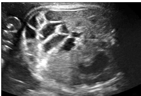
Fig. 1. Fetal sonograms of the male patient (32 and 2/7 weeks) showed dilated bowel loop.

One month later, the male was admitted for poor weight gain. Sucking was insufficient and he was irritable. He had hyponatremia and metabolic alkalosis. Blood gas analysis showed a pH of 7.645 and a base excess of +16.0 mmol/L. Other laboratory findings were serum sodium 115 mEq/L, serum potassium 2.6 mEq/L, serum chloride 57 mEq/L, urine sodium 8 mEq/L, urine potassium 3.2 mEq/L, urine chloride 9 mEq/L, urine osmolality 61 mOsm/kg H 2 O,