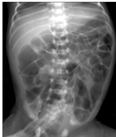
Fig. 2. Simple abdominal X-ray of the male patient taken in the neonatal intensive care unit. Diffuse air distension of bowel loops was observed.

The infant was admitted at 6 months of age because of diminishing body weight and developmental delay. He was only able to consume milk and could not eat solid food. He was unable to lift his head or roll over, did not grasp anything and rarely laughed or babbled. His body weight was 3.6 kg (corrected age, 4 months; below the 3rd percentile) and his height was 60 cm (corrected age, 4 months; 5th to 10th percentile). He again had hyponatremia and metabolic alkalosis. Urine osmolality was elevated and urine sodium was low: urine sodium < 10 mEq/L, urine potassium 8.9 mEq/L, urine chloride 8 mEq/L, urine osmolality 390 mOsm/kg H 2 O and serum osmolality 215 mOsm/kg H 2 O. Hypotonic hyponatremia with urine osmolality > 100 mOsm/kg, decreased extracellular fluid volume, and urine sodium