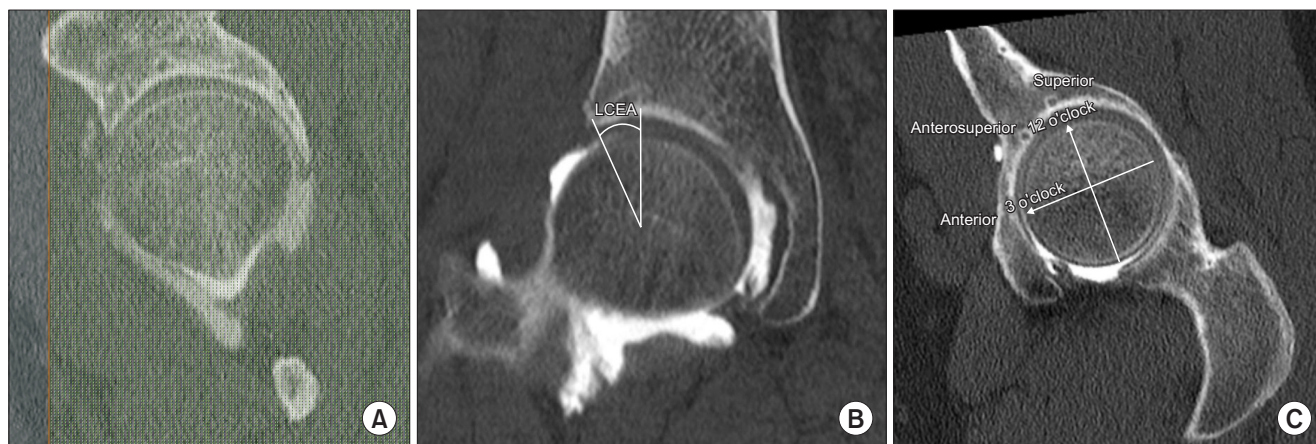
Fig. 2. Radiological measurements. (A) Coronal, axial, and sagittal computed tomographic arthrography reconstruction. (B) Lateral center edge angle (LCEA: the angle formed by a vertical line and a line connecting the center of the femoral head with the lateral edge of the acetabulum). (C) Location of each anchor according to the clock position.

The insertion angle was measured by extending