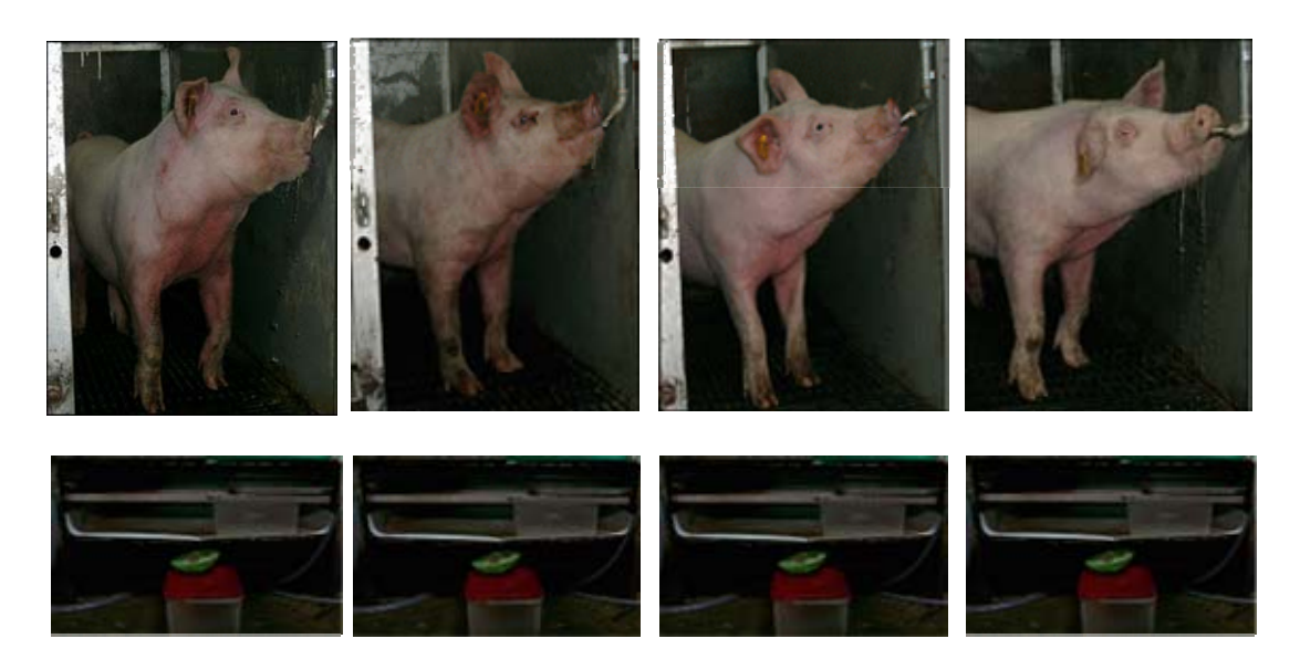
Figure 1. Features of pig to consume water forward nipple.

After a 7-day adaptation period, amounts of water supply, water intake, water disappearance and urine were measured for 4 days, after which a one-day transition period was provided. Nipple drinkers were then adjusted at shoulder height for each pig, and set at a flow rate of about 2 L/min, which is above than 0.7L/min from dong and pluske (2007). The pigs were fed 0.8 kg of diet twice daily at 08:00 and 20:00 and provided water ad libitum . All sampling was done 30 min prior to the 20:00 feeding. The water supply was monitored with a small water meter in each cage and the amount of water disappearance and urine