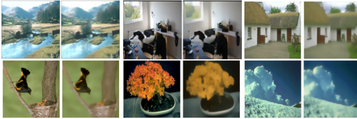
Figure 2. In each pair of images, the left side is the original BSDS image and the right side is the anisotropic diffusion BSDS image.