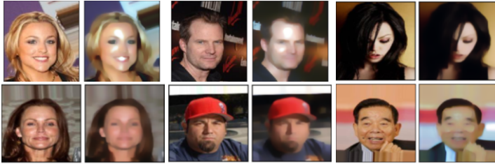
Figure 1. In each pair of images, the left side is the original celeba image and the right side is the anisotropic diffusion celeba image.

the left side is original images and the right side is anisotropic diffusion images. The anisotropic diffusion image is blurred than the original images. As we can see with BSDS and PASCALVOC anisotropic diffusion images results, the whole images are blurred but the shape of objects in images remains. Despite the data becoming more complex, the anisotropic diffusion result images still have their object's shape. Therefore, we could see that even complex images could be applied to our network.