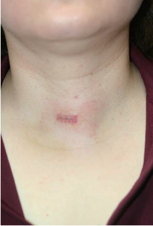
Fig. 2. The band-like scar tissue disappeared after surgery. The neck and chest moved separately.

Tracheal and soft tissue involving the dermis layer had adhered from the neck to the chest along the left approach track. After removing the scar tissue, the adhered site was covered with deep cervical fascia and subcutaneous fat tissue using an anti-adhesive agent. After surgery, the band-like scar tissue disappeared and symptoms improved (Fig. 2).