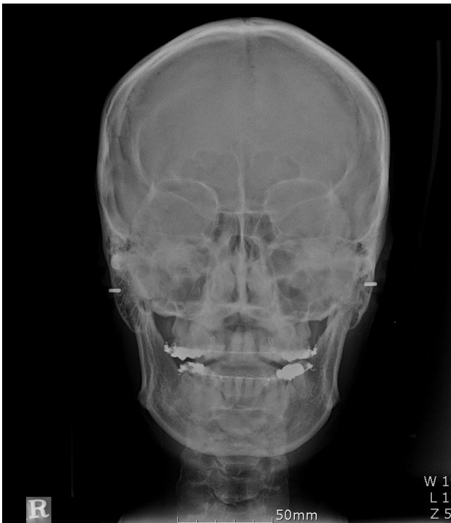
Fig. 1. Preoperative skull radiography. Preoperative skull radiography showed no remarkable findings.

A 34-year-old female patient (height, 168 cm; weight, 59 kg) was scheduled to undergo orthognathic surgery under general anesthesia for malocclusion and facial asymmetry. The patient had no medical history or specific findings other than orthodontic findings. Preoperative imaging examinations were performed, including facial and intraoral surface anatomy photography, panoramic X-ray photography, and cone-beam computed tomography, which showed no specific findings in either the nasal or nasopharyngeal regions (Fig. 1). Pulse oximetry, noninvasive blood pressure monitoring, and electrocardiography monitoring were initiated after the patient entered the operating room. Before the induction of anesthesia, her blood pressure was 110/70