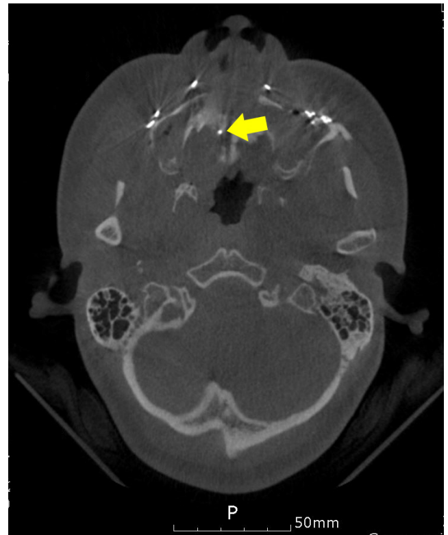
Fig. 4. Postoperative computed tomography of the skull. On computed tomography of the skull performed after the surgery, the metallic material in the right nasal cavity was identified. Tip of yellow arrow represent the micro-implant screw.

Nasotracheal intubation is generally performed when the oral route cannot be used in patients who have undergone