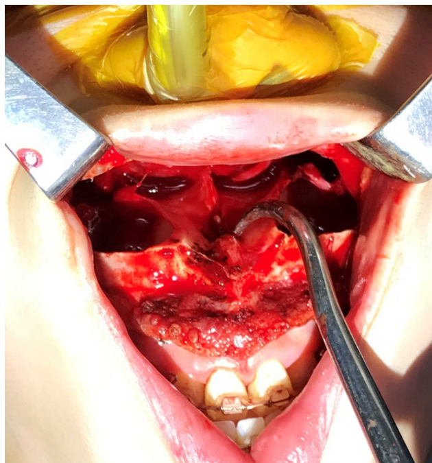
FIGURE 2. Intraoperative clinical photograph of nasotracheal intubation (NTI) after maxillary downfracture. NTI via a nasal Ring-Adair-Elwyn tube with an internal diameter of 6 mm was successful after maxillary downfracture.

the patient's nasal anatomy, both nasal endoscopy and CT can be used [1, 10]. For the patient in our case, nasal intubation was expected to be difficult because of the variation in the anatomical structure of her nose as shown by the preoperative cone beam CT. Anatomical variations, including nasal septum deviation, concha bullosa, and turbinate hypertrophy leading to nasal cavity narrowing, can interrupt the movement of the tube through the nasal passage [1]. There were no other factors found that could be expected to be difficult for intubation in our patient.