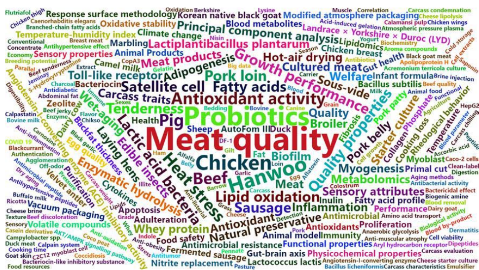
Fig. 2. Bigdata analysis for research keywords in animal products.

Keyword analysis of more than 200 recently published animal food-related papers revealed the following results. The total number of keywords mentioned in the paper was approximately 900, which is considered to indicate considerable diversity. As shown in Fig. 2, “meat quality” was the most frequently mentioned (15 studies), followed by “probiotics” (nine studies) and “beef”, “Hanwoo”, and “pig” (five studies each), while “antioxidant activity”, “growth performance”, “heat stress”, “lactic acid bacteria”, “lipid oxidation”, “pork loin”, “quality properties”, “satellite cell”, and “tenderness” were each mentioned four times. In the field of livestock food, research on meat quality has remained predominant, while probiotics have recently drawn interest and become a frequent