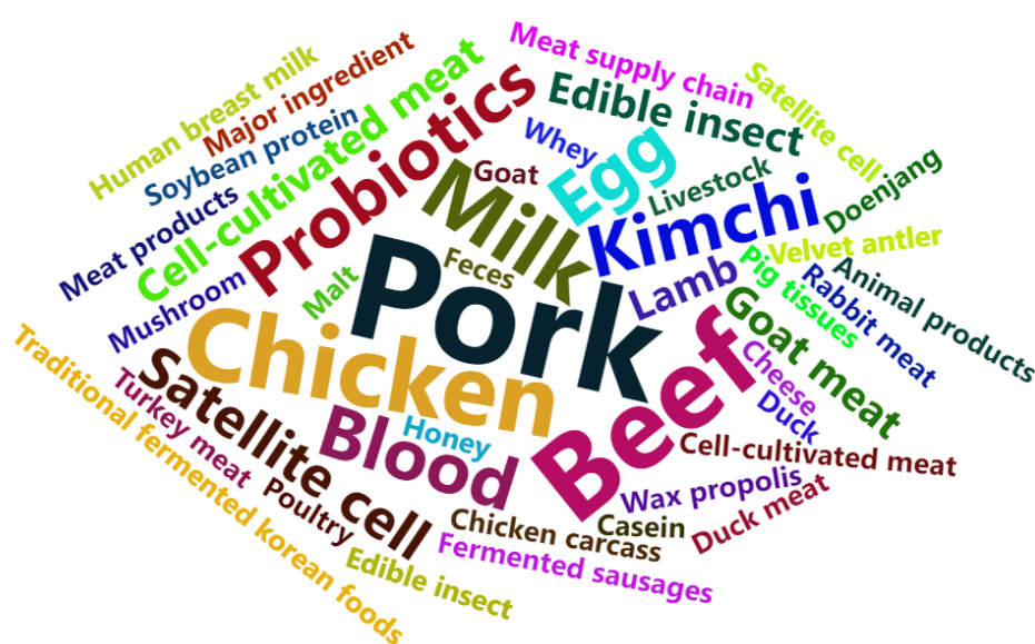
Fig. 1. Bigdata analysis for research materials in animal products.

As shown in Fig. 1 and Table 1, the most dominant livestock species in the Asian livestock sector are pigs, cattle, chickens, and sheep, and the most studied animal products are pork, beef, chicken, milk, and eggs. In fact, our study demonstrates that out of more than 200 livestock food-related research topics, pork is the most frequently studied livestock product, with over 30 studies, followed by beef and chicken, with more than 20 studies. In addition, milk and dairy products have been