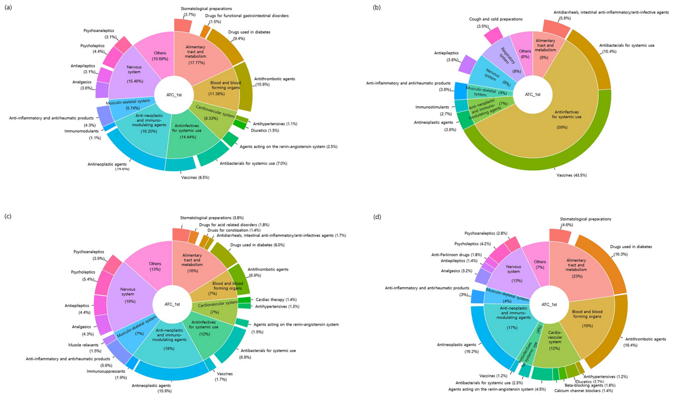
Fig 2. Common causative drugs of ADE-related ED visits. (a) Total, (b) children/adolescents, (c) adults, and (d) the elderly.

https://doi.org/10.1371/journal.pone.0272743.g002