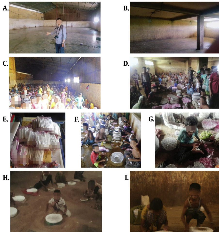
Fig. 2. Pictures taken at the bidi factory. (A and B) Empty workplaces in the factory during the weekend. (C and D) Crowded workspaces during a working day. In a four-storied building, all the floors were crowded with workers, including child workers. (E) Completed bidi packets: children were paid when they gave these packets to the manager. (F–I) Working conditions of the child workers: bare hands and feet of the child workers were exposed to the brown-colored tobacco powder. Tobacco powder was spread all around the workers.

Next, to fill the paper rolls, some workers purchased the tobacco powder along with the bidi papers and filled the rolls at home. However, most workers brought empty rolls to the factory, so that they can be filled with tobacco. Child workers with or without their adult guardians came to the factory with bunches of empty bidi rolls. In the bidi factory, there were no spaces or machines specifically designed for producing bidis. Effective ventilation systems were not available, and the size and number of windows were not adequate. Tobacco powder was scattered all over the floor, and a strong, sharp smell of tobacco permeated the entire space. The workers gathered the powder using bare hands and poured the powder over a bunch of empty bidi rolls. Then, they shook the rolls to evenly distribute the powder. After filling the rolls, the workers wrapped them one by one to close the fire-side of the bidi to prevent the tobacco powder from spilling out. During this process, tobacco powder was expelled into the air (Fig. 2).