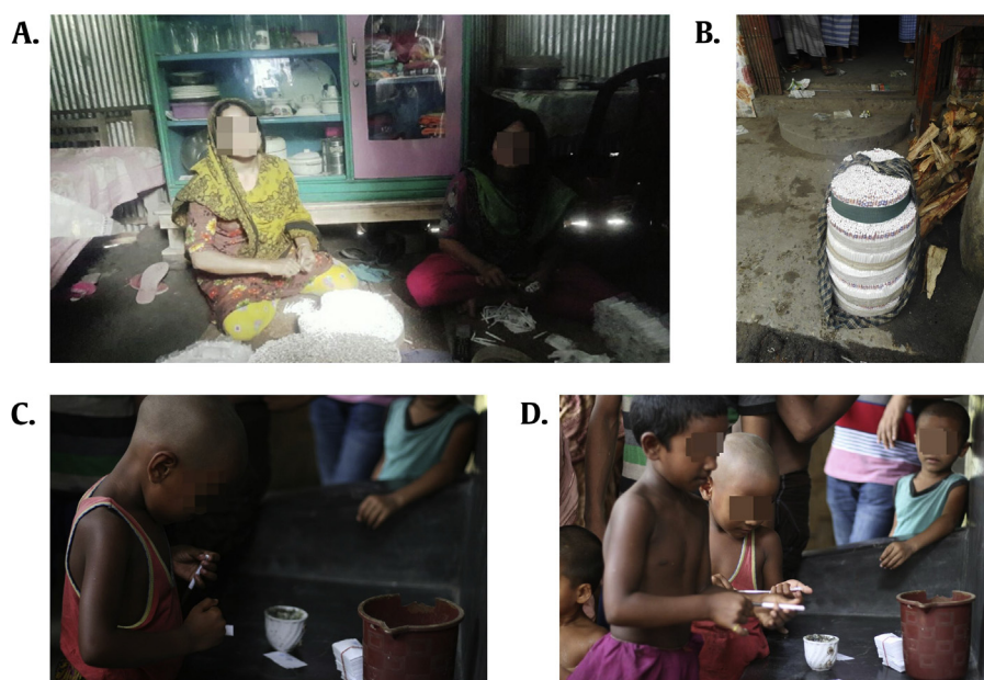
Fig. 1. Pictures taken at village areas and local communities. (A) A mother and her daughter making bidis at their home. (B) Bundles of empty bidi rolls prepared for being brought to the factory. (C and D). A boy and his older brother demonstrate how to make a roll to visiting researchers (informal sector).

Card-sized papers were distributed to the workers. Usually, one family member visited the factories and purchased the papers to bring them home. Family members who did not work outside the home participated in rolling because it was perceived as a safe and easy way to make money. Two participants, who were siblings, demonstrated the roll-making process to the researchers. Simple metal sticks were used to make bidis of uniform thickness, and glue was used to fix. First, the workers placed the paper on the hand and rolled it around the stick. Then, the rolls were fixed by applying glue (dark gray-colored, ingredients unknown) with bare hands. Next, the bidi brand symbol was attached on the mouth side, and the roll was closed. Fig. 1C and D show images of an ordinary home in the local community. By repeating the abovementioned steps, the workers made thousands of empty paper rolls at home and tied them into bundles with a band.