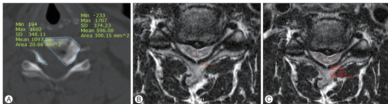
Fig. 1. Sketch diagram of measurement of vertebral body resection area (A), AP diameter (B), and transverse area (C) by TeraRecon Workstation.

ual non-radicular discomfort, “fair” when the patient showed mild residual symptoms of radiculopathy with or without mild/moderated residual non-radicular discomfort, and “poor” when the patient continued to show significant radicular symptoms with or without non-radicular discomfort.