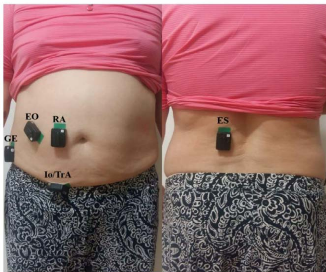
Figure 3. EMG electrodes on abdominal muscles and the erector spine. EO = external oblique; ES = erector spinae muscle; GE, ground electrode, lo/TrA = internal oblique and transversus abdominis, RA = rectus abdominis.

the electrode was positioned 1 to 2 cm medial and below the anterior superior iliac spine (ASIS). [29] The electrode was placed parallel to and approximately 3 cm lateral to the L3 spinous process to measure ES. [30] The ground electrode was then placed on the ASIS.