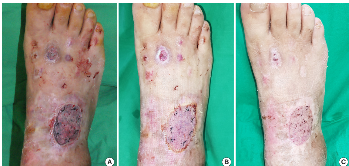
Fig. 2. Immediate postoperative and outpatient follow-up photographs. (A) Immediate postoperative condition of a second-degree burn on the dorsum of the right foot of a 62-year-old female. (B) Condition of the wound on the 7th postoperative day. (C) Condition of the wound 2 weeks after the skin graft.

As STSGs are very thin, they are prone to damage when the surgeon applies the very sticky Dermabond and manipulates the graft. Therefore, as presented in this study, damage and loss of the skin graft can be prevented by applying Dermabond