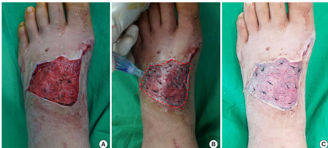
Fig. 1. Application of Dermabond to the dorsum of the left foot. (A) Preoperative photograph of a trauma-induced skin defect on the dorsum of the left foot of an 18-year-old male. (B) Dermabond (2-octyl cyanoacrylate glue) is applied along the red dashed line between the excess graft margin and normal skin around the wound. (C) Condition of the wound on the 7th postoperative day.

An 18-year-old healthy male sustained a laceration to the dorsum of his left foot from a motorcycle accident. He underwent