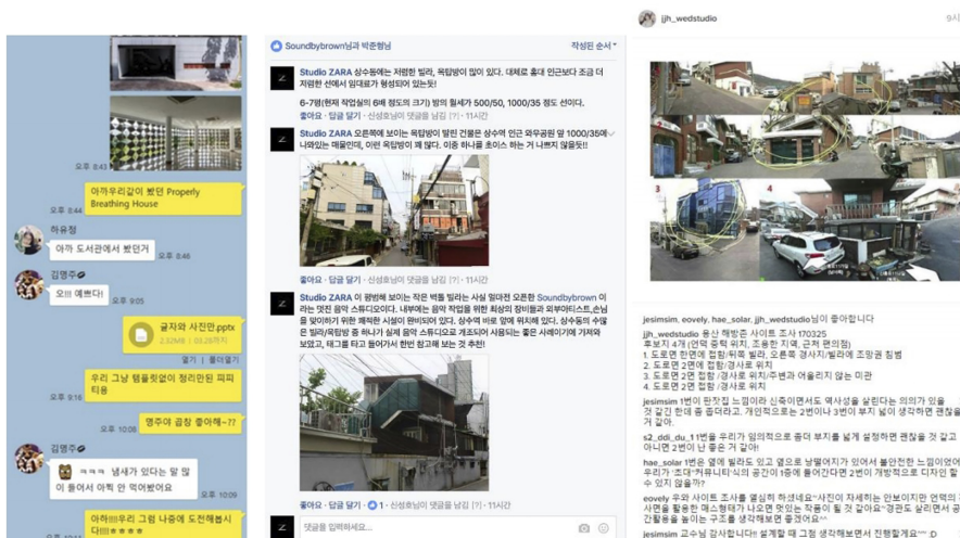
Figure 1. Captured Images: (a) Closed-chat platform (b) Facebook and (c) Instagram

We focused on three collaborative design environments: Group K, Group F and Group I with a detailed analysis of design communication. We selected nine teams – three from each group – because Group F had only three teams. This study is an explorative examination of design collaboration in SNSs. We analysed the protocols of five weeks of design communication in the conceptual stage of design based on a customised coding scheme. To assign codes, we segmented the protocols along each student utterance and uploaded information including