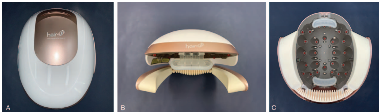
Figure 1. External appearance of the clinical devices. The experimental and sham devices had the same appearance. A. Upper surface, B. Front view, C. Inner surface.

Subjects visited the medical center for evaluations at 0, 8, and 16 weeks (visit 1, visit 2, and visit 3). At the first visit, patients' demographic information was obtained, and a physical examination was performed that included checking patients' vital signs. Global photography and a phototrichogram were performed at baseline (screening test), as well as at 8 and 16 weeks. Participants' satisfaction and perceived improvement were