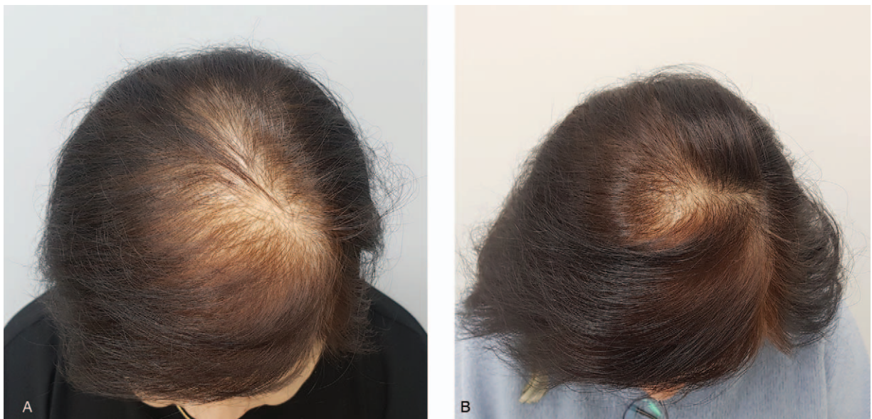
Figure 4. Hair vertex view of global photography of a 62-yr-old female patient in the treatment group, diagnosed with Ludwig type II hair loss. Compared to baseline, there was a 25% increase in hair density and a 3.1% increase in hair thickness at 16 wk. A. Baseline, B. 16 wk.