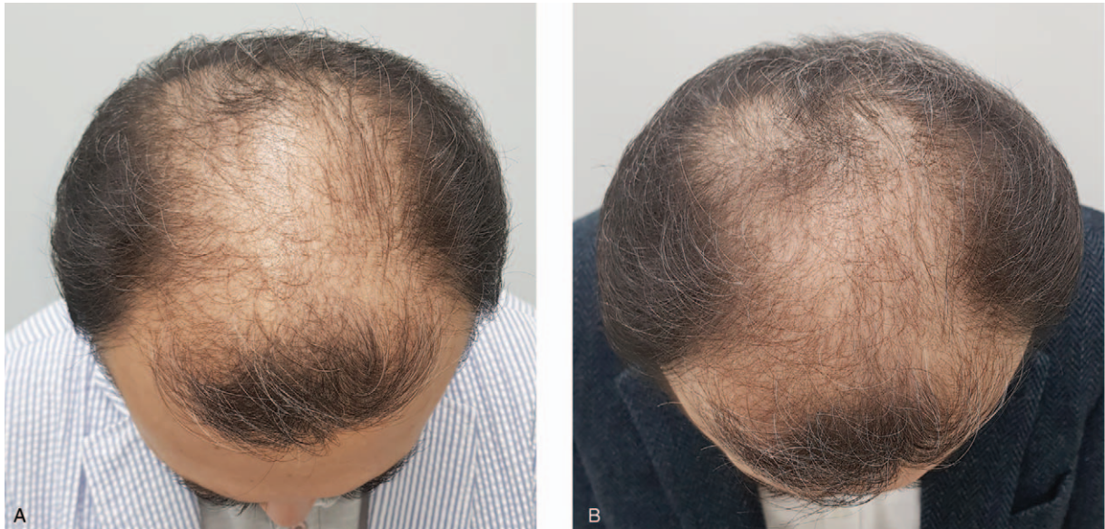
Figure 3. Hair vertex view of global photography of a 59-year-old male patient in the treatment group, diagnosed with Norwood-Hamilton type V hair loss. Compared to baseline, there was a 50% increase in hair density and a 14.9% increase in hair thickness at 16 wk. A. Baseline, B. 16 weeks.

* ANCOVA was conducted after adjusting the following variables: age, sex, site, the intersection of age & site, and the intersection of sex & site.