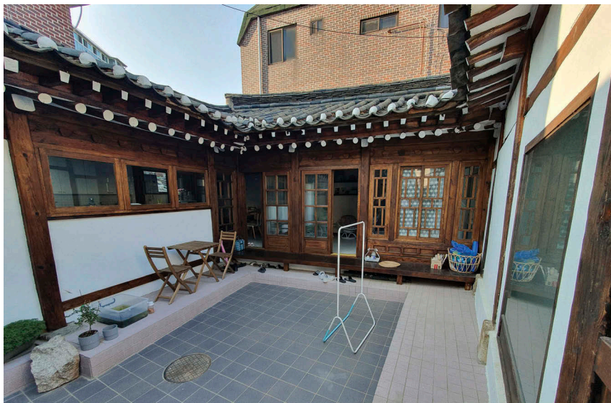
Figure 1. Traditional Korean house.

Other than establishing a boundary and protecting privacy, a wall also functions as a defensive measure. However, the walls in a Korean residence are only about 1.5–2 m in height, which minimally impairs the line of sight and can easily be traversed. Walls at this height create a space that is somewhere between being open and closed off, so the perception of such walls as a defensive measure is mostly psychological (Lee 1997). Taylor and Nee (1988) revealed that 71% of burglars prefer to trespass by jumping over a wall. It is also noteworthy that houses with walls can arouse criminal desires because, once inside the wall, burglars can easily observe the area outside the wall without being seen by neighbors. Sorensen (2003) confirmed that burglars avoid targets that are readily observed by neighbors and/or passers-by. Places with high walls/fences, low lighting at night, and thick trees or shrubbery provide concealment opportunities, particularly when such obstacles are close to points of access such as windows and doors (Weisel 2002). Therefore, homeowners should consider crime prevention strategies before the occurrence of a crime, and it is necessary to increase the difficulty of committing a crime by increasing the risk of detection and ensuring that committing a crime is not profitable.