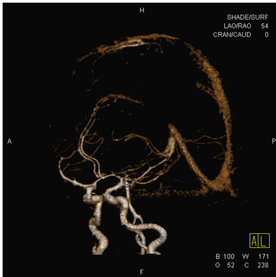
Fig. 1 MRI image showed superior sagittal sinus thrombosis with acute infarct and mild subarachnoid haemorrhage

That night, she had an episode of seizures. Endotracheal intubation was done to secure the airway. She was transferred to an intensive care unit. Magnetic resonance image (MRI) showed superior sagittal sinus thrombosis with acute infarct and mild subarachnoid haemorrhage (Fig. 1). For CVT treatment, low molecular weight heparin (enoxaparin sodium, Cnoxane, 60 mg) was injected subcutaneously two times during one day and for intracranial pressure control, an osmotic diuretics (Cerol) was injected. Despite these medical treatments, intracranial pressure continued to rise. The next day, her mental state changed to stupor. Brain CT showed diffuse brain swelling and aggravating venous infarct. An emergency decompressive craniectomy was performed. During the surgery, severe brain oedema and venous thrombosis were noted. (Fig. 2). After surgery, low molecular weight heparin was continuously administered with previous method during 10 days and monitoring aPTT according to neurologist consultation. Her