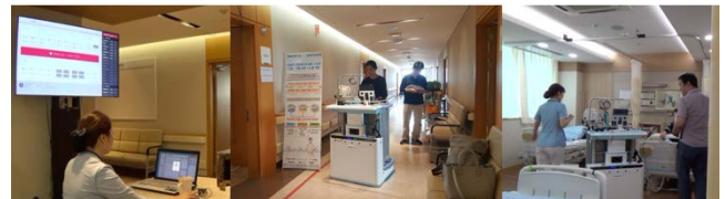
Fig 1. clinical testing for Co-care service

Because this kind of integrated nursing robot service does not exist yet in Korea, we conducted the clinical test in a real general hospital ward. However, we could realize that the current ward environment is highly insufficient to support the Co-Care system. This is not just a matter of certain dimensions or elements; the highly complex and technology-based system's environment should be approached with different viewpoints from the current ward environment.