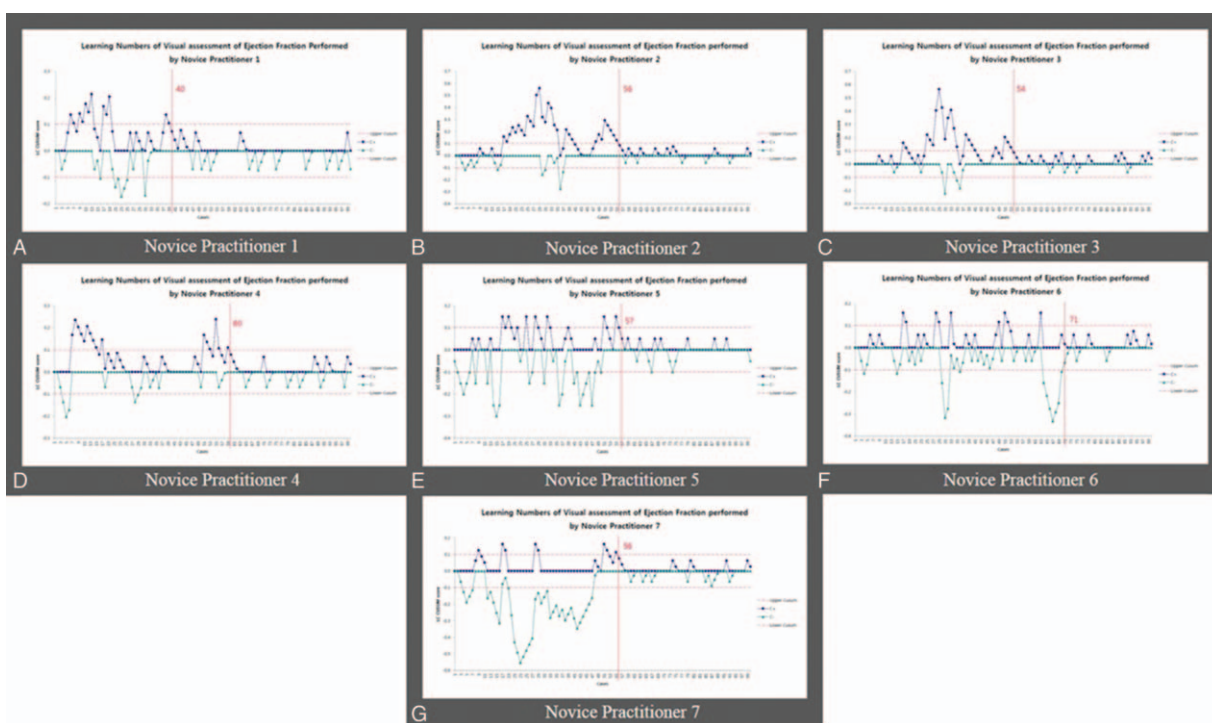
Figure 2. Each novice practitioner's Learning Curve-CUSUM charts.

range. When the graph approaches this limit, it stays in the limit area, which includes zero, and monitoring continues. Therefore, the participants do not have to compensate for all the accumulated failures to show acceptable performance. The CUSUM is designed to detect a shift from an adequate to an inadequate performance level. The concordance outcome is recorded above the x-axis. The CUSUM score increased with discordance and decreased with concordance between the gold standard and the EF value estimated by the participant. The CUSUM can be used after the LC-CUSUM has shown that the novice practitioner reached proficiency to ensure that the performance is maintained within an acceptable range.