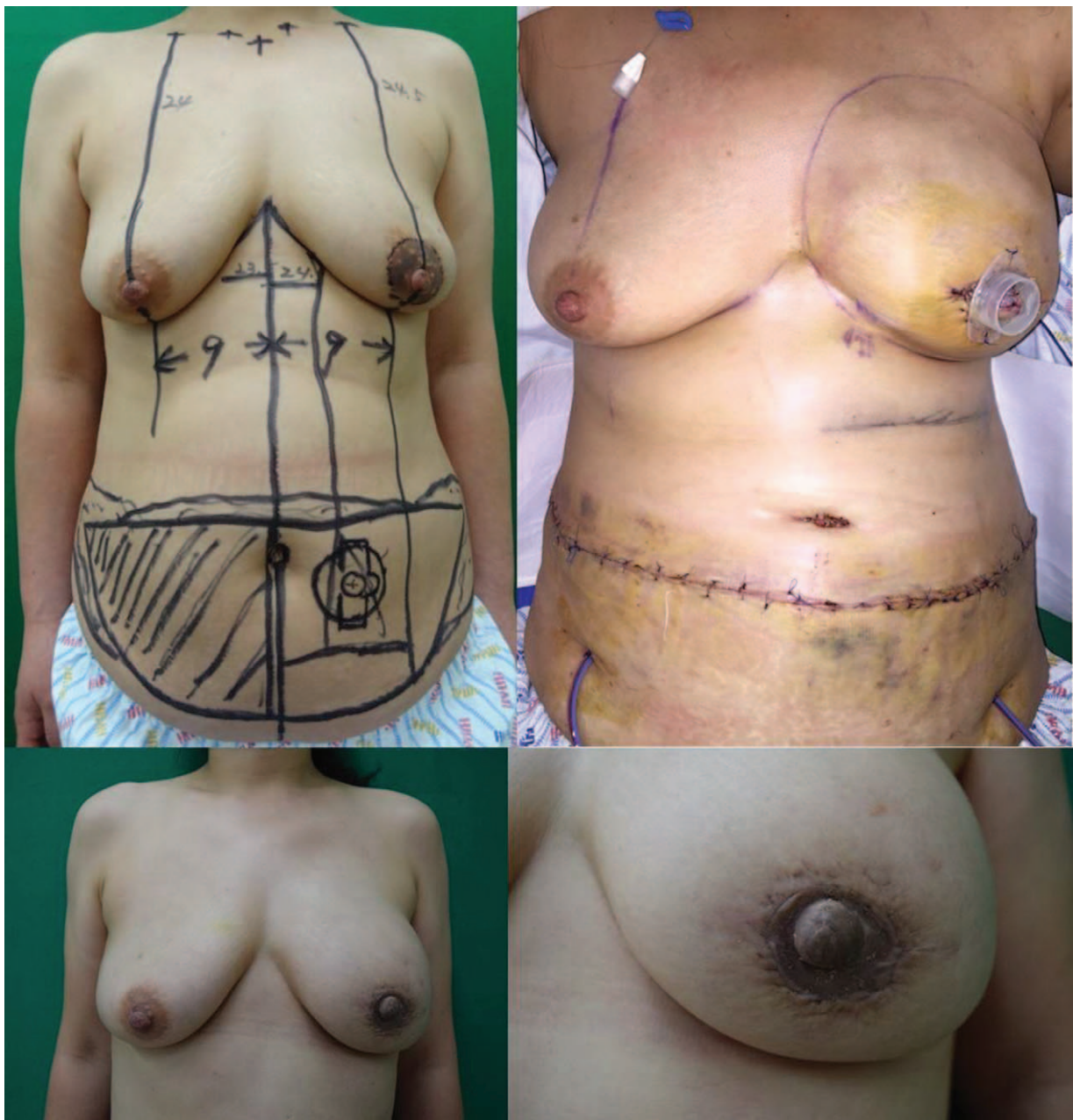
Figure 3. A 46-year-old female patient who underwent skin-sparing mastectomy. An immediate pedicled TRAM flap and a modified C-H flap were performed simultaneously. Preoperative (above left), immediately postoperative (above right), and 1-year postoperative (below left and right) photographs were taken. One year postoperatively, the projection of the reconstructed nipple was 10mm and the width was 14mm. TRAM=transverse rectus abdominis musculocutaneous.

B cases which showed too much edema on the reconstructed nipple. If the flap is too edematous, there can be a marginal necrosis or congestion on suture sites. In such cases, only the subdermal suture was performed at first, and a skin suture on the C-H flap was performed approximately 3–5 days after the nipple reconstruction to reduce the tension on the flap skin.