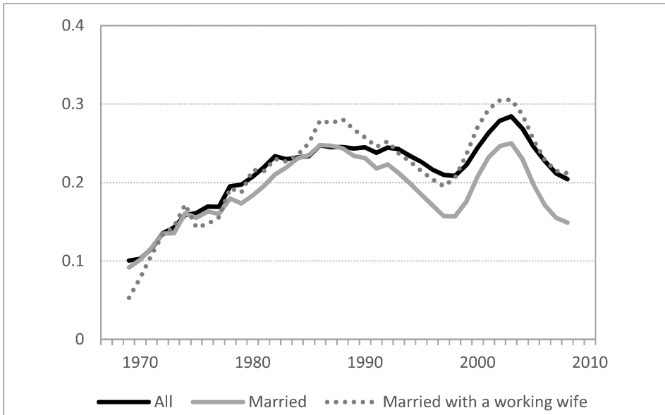
[Figure 3] The Share of Transitory Wage Shocks in the Variance of Log Residual Wages

Note: Each line indicates the share of transitory wage variance in the sum of transitory and persistent wage variances.