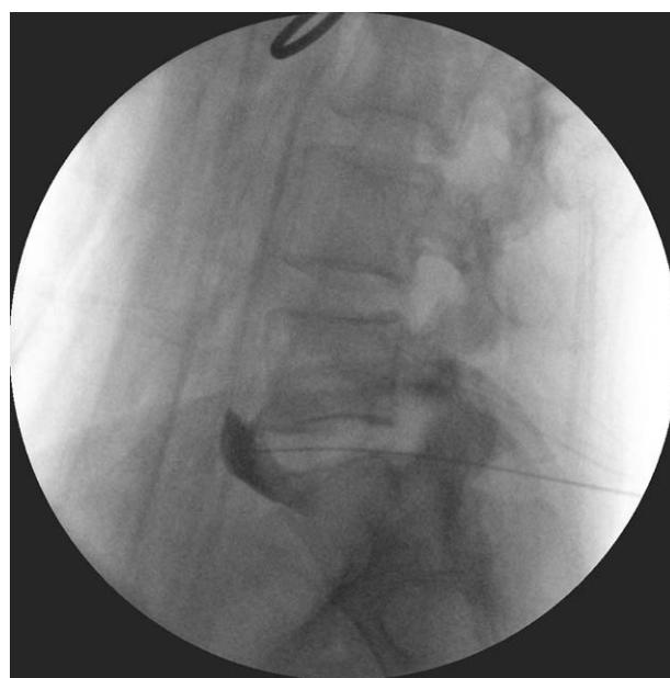
Figure 1. Lateral fluoroscopic view of the lumbosacral spine showing the spread of the radiocontrast anterior to the L5–S1 intervertebral disc.

mepivacaine (100 mg) and 1 mL of dexamethasone (5 mg) through the needle relieved the lower abdominal and perivulvar pain (VAS pain score of 2) and reduced the frequency of urination during daytime hours to once every 2 h for 5 h.