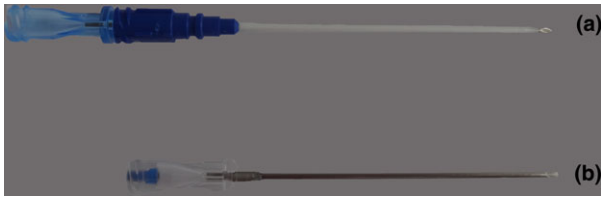
Figure 1 The two types of introducer needle used in this study. (a) Catheter-over-needle. The distance between the needle tip and catheter tip is approximately 2.0 mm. The 18G radiopaque catheter (outer diameter 0.9 mm, total length 8.8 cm, flexible sheath 6.3 cm) is threaded over the 20G access needle and then used as a guiding sheath for the guidewire. (b) Thin-walled introducer needle. The standard 18G access needle (outer diameter 0.9 mm, total length 8.8 cm, needle shaft 6.3 cm) is directly used for guidewire insertion.