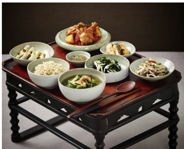
Fig. 3. Kaeul bapsang , an example of a simple seasonal bapsang . New-harvest rice, aukdoenjangkuk , dakbokeumtang , dububuchim , beoseotnamul , paramuchim , chongkak-kimchi are served with kanjang .

namul dishes and 20% high protein dishes that are made with meat, fish, eggs, or tofu. The varieties of banchan offer a healthy, balanced diet that is rich in nutrients and phytochemicals. All dishes are served on a table at once so that people can consume them based on their needs and preference.