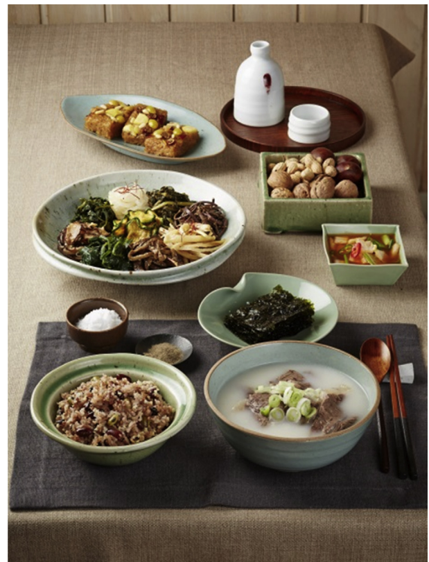
Fig. 2. Jeongwol Daeboreum-sang . This bapsang is served on Jeongwol Daeboreum-sang , the 15 th day of the lunar calendar. It consists of okokbap , gomkuk , and namul from the past year (eggplant, bracken, squash, dried radish greens, aster, pepper, cucumber, mushroom), kingui , nabakkimchi , yaksik , and bureom . People share kwibalkisul with the meal and wish for good health and fortune in the upcoming year. Kwibalki means ear-quickenening.

Bapsang served in the autumn follows the basic structure of K-diet described in Fig. 3. This structure of bapsang was established in the Chosun dynasty. It consisted of bap made with new-harvest rice and other grains, kuk , kimchi , and various banchan . Depending on the available ingredients, mothers would make banchan using an appropriate cooking method, such as the ones suggested in Table 1. Then they would season with jang , garlic, green onions, ginger, red pepper powder, sesame, or perilla oil. In this sense, banchan can be considered as a bricolage food. Banchan typically consists of 80%