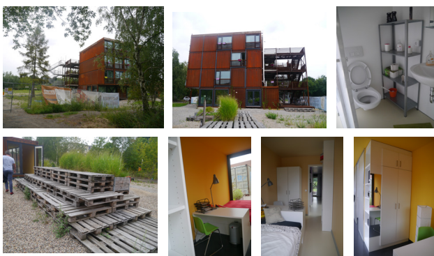
Fig. 3. Indoor and Outdoor Environment – Eba51

The idea of comfortable housing with a low cost prompted the construction of Eba51.