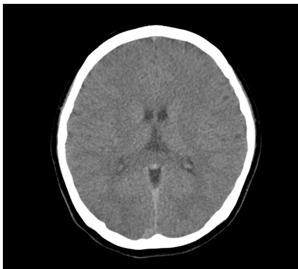
Fig. 3. The findings of brain computed tomography. Brain computed tomography on hospitalized day 2 showed an attenuation of lobar gray-white matter differentiation.

tests showed a total bilirubin value of 0.20 mg/dL; an aspartate aminotransferase of 9.0 U/L; and an alanine transaminase of 88 U/L. Troponin-I was 0.01 ng/mL, and Creatine Kinase MB Isoenzyme was 1.0 ng/mL. About 90 minutes after ROSC, the patient transferred to our ED for management of post-cardiac arrest syndrome. At arrival to our ED, she was sedated by continuous infusion of midazolam and vecuronium bromide, and her vital signs were body temper-