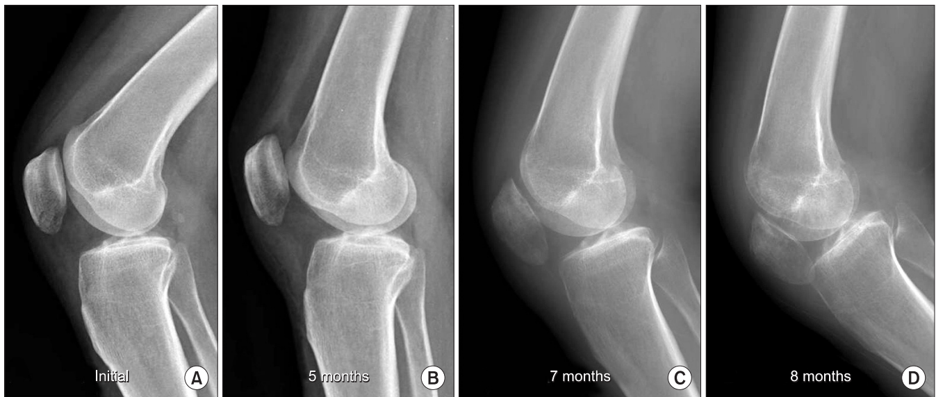
Figure 1. Preoperative radiographs. Patella infera is shown at 7, 8 months after initial trauma. (A) Initial radiograph showing a minimally displaced transverse fracture at the inferior pole of the patella. (B) Post-trauma 5 month radiograph showing progression of union without patella infera. (C) Post-trauma 7 months, and (D) 8 months after trauma.