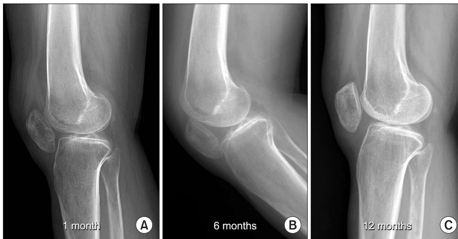
Figure 4. Postoperative follow-up radiographs. Progressive improvement of patella position is visible. (A) Postoperative 1 month, (B) postoperative 6 months and (C) 12-month follow up radiograph. The Insall-Salvati ratio was calculated to be 0.55.

was present. The lateral radiographs revealed an Insall-Salvati ratio of 0.41 (Fig. 1C) and further decreased over a month (Fig. 1D). The magnetic resonance imaging showed hypertrophied soft tissue from retropatella fat pad area to medial retinaculum (Fig. 2A). In addition, thickened patella tendon with intrasubstance signal change was also identifiable (Fig. 2B).