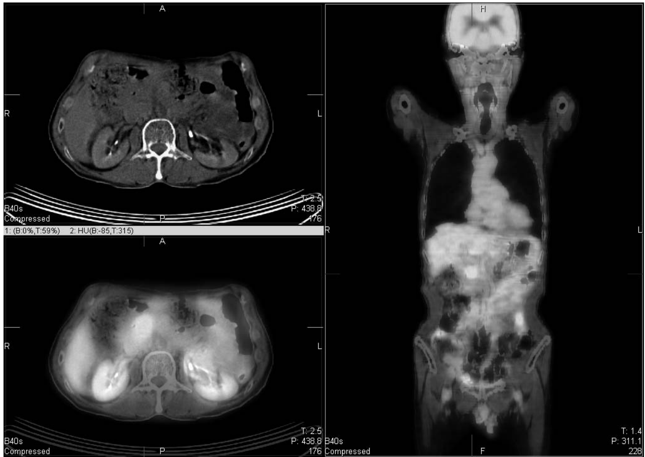
Fig. 2 PET CT scan of Case 1. There was a 1.6 \times 1.6 \times 1.8 -cm hypermetabolic mass in the pancreatic head and small lymph nodes in the retropancreatic region without FDG uptake. Physiologic uptakes of the anastomotic site of the esophagus and small intestinal loops.

of the distal common bile duct and ligation of the gastroduodenal artery were performed. The portal vein was exposed, and a tunnel was created anterior to it and traced to the tunnel made previously inferiorly. A Nelaton catheter was inserted in this groove.