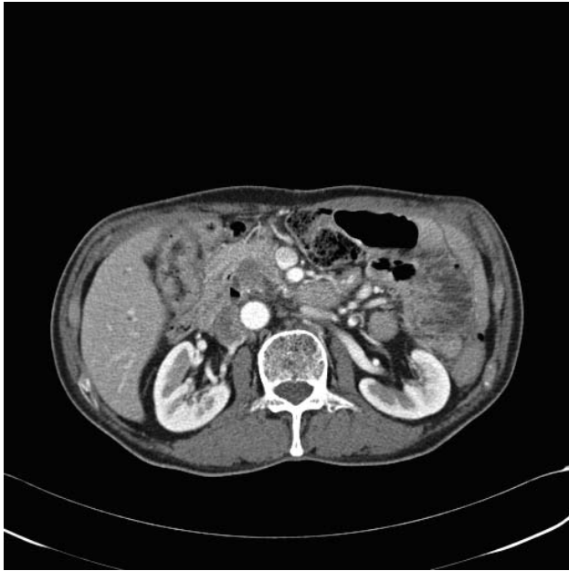
Fig. 1 Abdominal CT scans of Case 1. An \approx 1.8-cm ill-defined mass was found in the pancreas head, with distal CBD obliteration and progression of upstream main p-duct dilatation.

of 500 mL, and no blood transfusion was required. The postoperative upper gastrointestinal (GI) series taken after 5 days showed no contrast leakage at the anastomosis site and no evidence of passage disturbance, and he was started on a liquid diet. Voiding difficulty developed postoperatively at 19 days, and a Foley catheter was inserted. There was continuous serous discharge at the main wound, and wound closure was delayed to 30 days postoperation. After 1 month, he complained of poor oral intake and was supported by peripheral nutrition. Finally, he was discharged at 47 days postoperation.