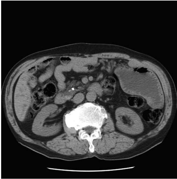
Fig. 3 Abdominal CT scans of Case 2. There is high attenuation lesion on the precontrast scan in the intraluminal portion of the CBD, with abrupt luminal narrowing of the distal CBD. There is no definite wall thickening of the bile ducts. Pancreas shows an 1.3-cm low-attenuation lesion in head portion with mild dilatation.

jejunojunctionostomy was performed. A few interrupted sutures were placed between the jejunum, retroperitoneum, and small bowel mesentery to close small gaps and prevent further jejuna migration into the supracolic compartment. Care was taken to ensure that the previous jejunojunctionostomy was not kinked and that there would be no tension on the pancreatic and biliary anastomoses (Fig. 6).