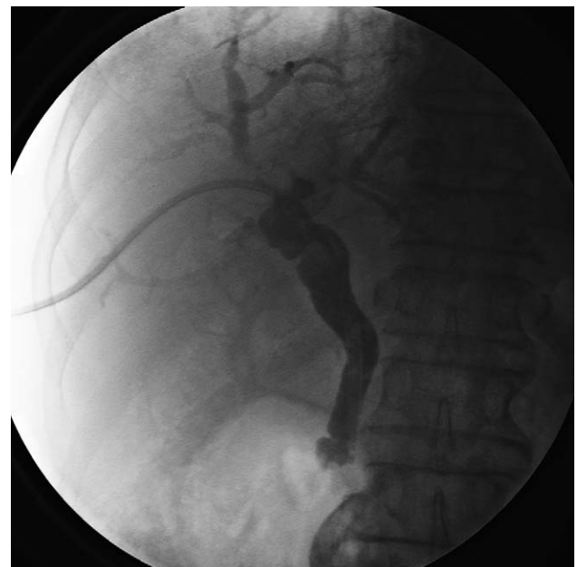
Fig. 5 PTCS of Case 2. The PTCS catheter was placed at the distal CBD.

2 intraoperative blood transfusions for 1 patient. The mean length of surgical intensive care stay was 1 day, and patients were discharged home by days 34 and 47 postoperation. The final pathology in both