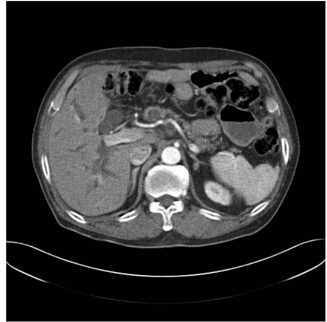
Fig. 4 There is marked dilatation of the peripheral portion of the IHD and CBD. The patient showed definite IPMN mass, indicating possible cancer change in the mass.

There were no complications in the 2 patients, and outcomes are summarized (Table 1). The mean operative blood loss was 900 mL. The mean operative time was 8 hours, 15 minutes. There were