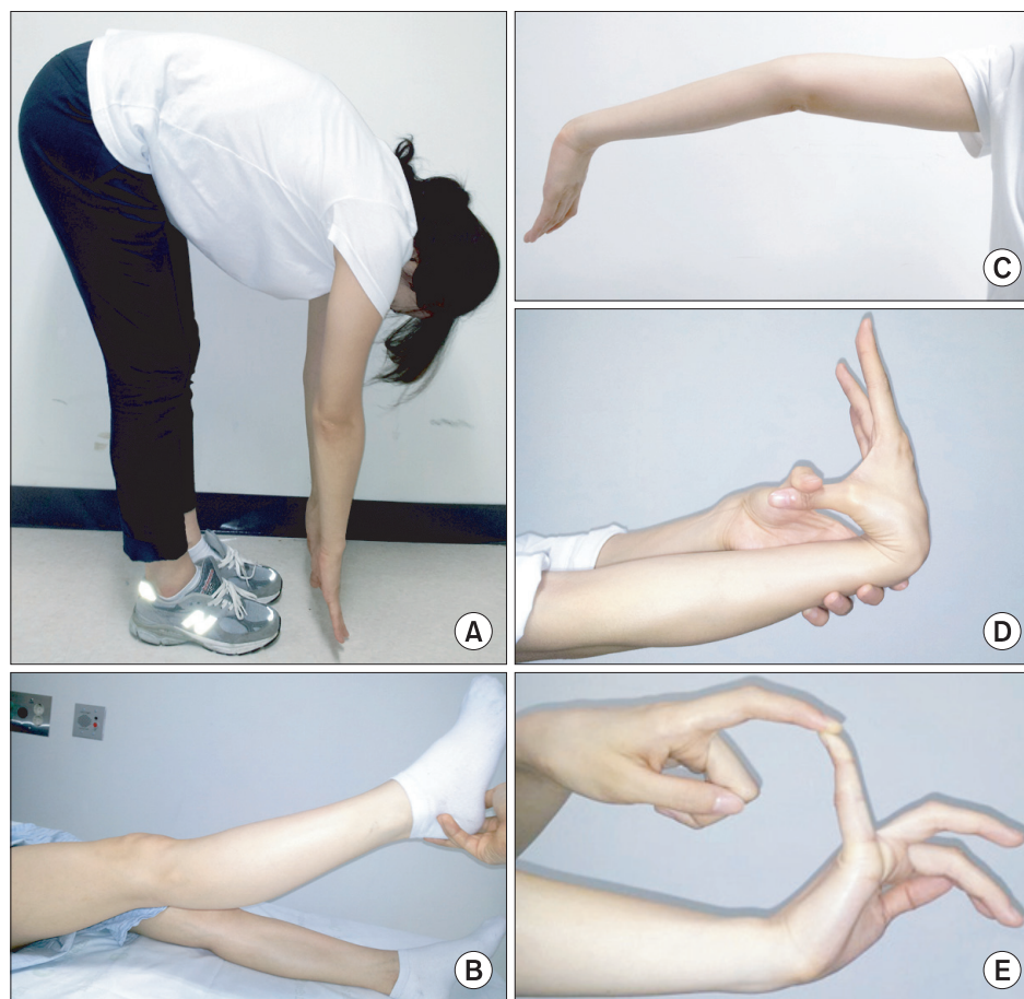
Fig. 1. Assessment using the Beighton hypermobility scoring system: (A) forward flexion of the trunk with the knees straight so that the palms of the hands rest easily on the floor, (B) hyperextension of the knee beyond 10°, (C) hyperextension of the elbow beyond 10°, (D) passive apposition of the thumb to the flexor aspects of the forearm, and (E) passive dorsiflexion of the fifth fingers beyond 90°. (A) was scored 1 point, and (B), (C), (D), and (E) were scored 2 points on both sides.

17.0 for Windows (SPSS Inc., Chicago, IL, USA). First, a descriptive analysis was performed. Differences in the Beighton scores and percentages of GJH between the two groups were tested for significance using the t-test or chi-square test as appropriate. The t-test was used to compare differences in localized hypermobility of each joint, whereas Spearman correlation coefficient was used to evaluate the correlation between the Beighton score and several other factors including age and employment duration. The chi-square test was used to test independence or determine the kappa index. Statistical significance was set at a p=0.05 for all tests.