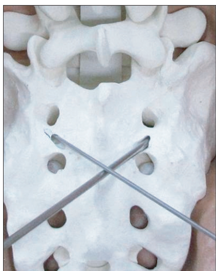
Fig. 1. Entry point of the S2 alar screw (arrow) and the midpoint of the line from the medial margin of the S1 dorsal foramen and the medial margin of the S2 dorsal foramen.

itself. The probe was inserted along the cortex with a mallet. It's important that maintain the probe exact trajectory to the anterior cortex hole. The probe was reinserted along the anterior cortex to assure the exact trajectory of the S2 6.0-mm-diameter screw. An attempt was then made to place the screw with the tip contacting the triangular area of cortical bone at the anterior, inferior, and lateral boundaries of the sacral ala without penetrating through these boundaries. Lateral penetration of the screw will violate the sacroiliac joint, which could result in painful arthropathy.