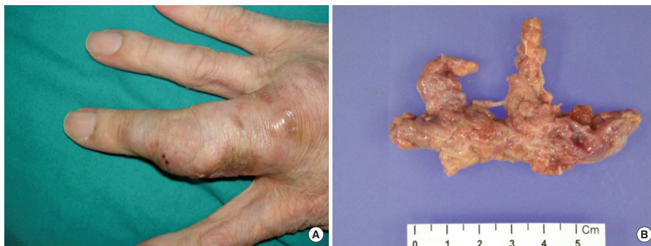
Fig. 1. (A) Subcutaneous lesion on the third finger of the right hand; (B) 6.5 × 3 × 1.2 cm-sized mass obtained after removal of the lesion.