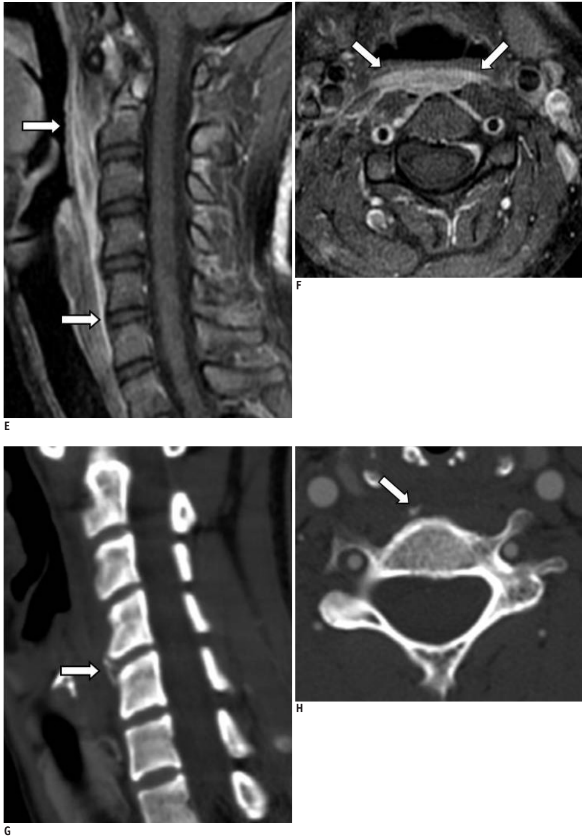
Fig. 1. Acute retropharyngeal calcific tendinitis in 30-year-old woman.

E, F. Enhanced sagittal ( E ) and axial T1-weighted ( F ) images with fat suppression showing markedly decreased amounts of fluid collection and prevertebral soft tissue swelling (arrows) after just 10 hours. G, H. Sagittal reformatted ( G ) and axial ( H ) images showing amorphous calcification (arrows) at right para-midline location anterior to C4-5 disc.