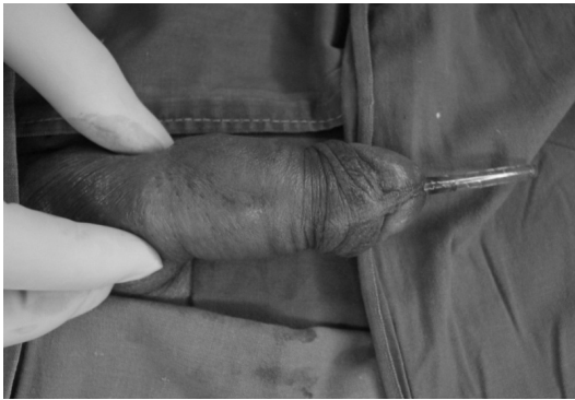
Figure 3. A green colored tube projecting from the external meatus.