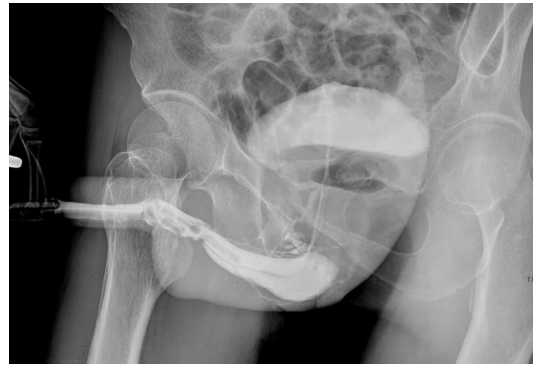
Figure 4. Abnormal extravasation of contrast in bulbous urethra was seen on retrograde urethrography (RGU).

not pull out a green-colored tube inserted in the urethra 3 hours previously was referred to our clinic for retrieval of the foreign body. A 5cm of green-colored tube was seen projecting from the external urethral meatus (fig. 3).