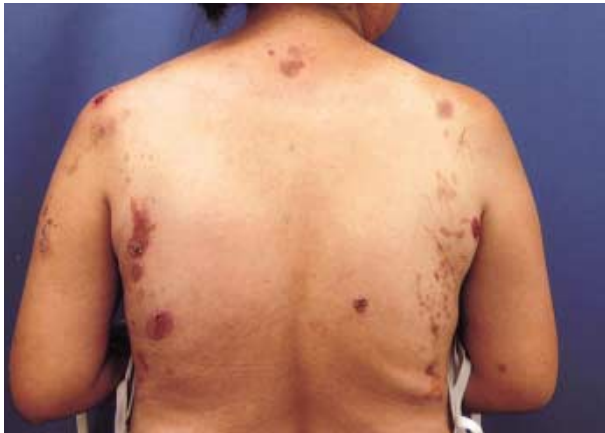
Fig. 1. Erythematous patches and superficial erosions with pustular bullae on axillae and back of the patient.

ued and the patient was placed on oral prednisolone 20 mg daily. The skin lesions rapidly improved, and disappeared within 2 months.