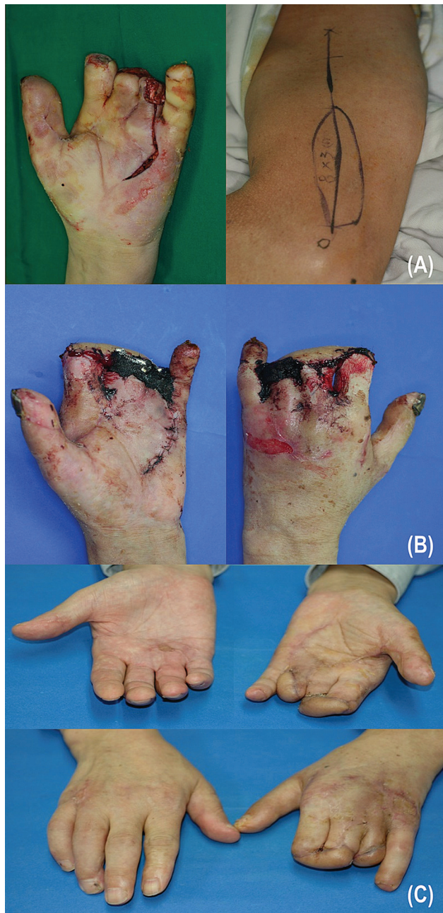
Fig. 2 Case 2. (A). Soft tissues defect of the index, middle, and ring fingers (Lt). A 8 \times 3 \text{ cm}^2 -sized lateral arm free flap (Rt). (B) Temporary syndactylization. Volar view (Lt). Dorsal view (Rt). (C) At 6 weeks after the free flap, the ring finger was separated. Volar view (upper). Dorsal view (lower). Lt, left; Rt, right.

arterialized venous flaps 6 and free toe pulp flaps. 7 Although high success rates have been reported for arterialized venous flaps, their use for finger defects is limited by safety concerns and flap monitoring difficulties. 6 The use of a partial pulp tissue as a small free flap, as popularized in Korea and subsequently in other Asian countries, provides an elegant means of reconstructing fingertip defects and can effectively restore sensory function. 7 However, this tissue is not suitable for covering larger defects and is not considered the option of first choice for finger dorsal defects. Although multiple free flaps can be used to cover