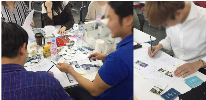
Figure 2 Participants using the LUX Cards during the workshop

Participants were grouped into four teams, on each of which were four members. All participants signed the consent form.