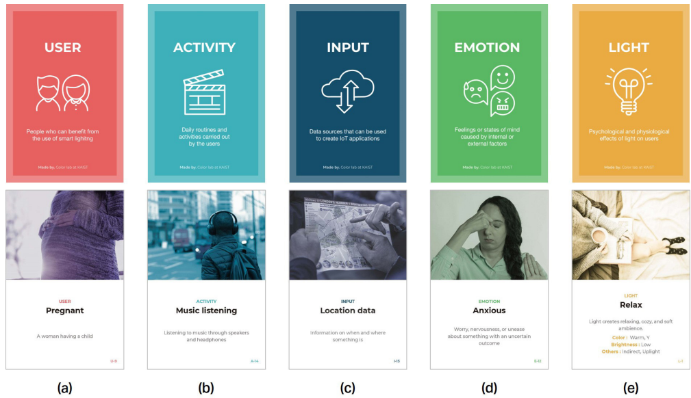
Figure 1 Initial version of the LUX Cards

User cards (Figure 1(a)) address diverse user groups who can benefit from the use of smart lighting, such as pregnant women, multi-person households, and pet owners. Activity cards (Figure 1(b)) provide daily routines and activities that may be performed in the major application areas of smart lighting. These cards include activities that take place in smart homes (e.g., reading, TV watching) and/or autonomous vehicles (e.g., drowsing, listening to the radio). Input cards (Figure 1(c)) cover data resources that can be applied to generate IoT solutions. Inputs depicted on cards belong to the following categories: internet services (e.g., mail, schedule), public application program interfaces (e.g., weather data, traffic information), sensors (e.g., sound sensor, posture sensor), and physical devices that provide or store information (e.g., activity trackers, smart furniture). Emotion cards (Figure 1(d)) cards address feelings or states of mind (e.g., enthusiastic, bored, lonely) caused by internal or external factors. Light cards (Figure 1(e)) describe the relative merits of different types of lighting based on their impacts on and benefits to the end user. For example, smart lighting can create a relaxing, cozy, and soft ambience by setting the light to a warm, yellow or orange color with low to medium brightness. Likewise, different types of lighting impact users in different ways, both psychologically and physiologically.