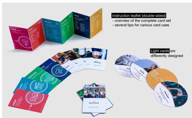
Figure 4 Edited version of the LUX Cards

In this section, we identified the areas that need improvement, based on the suggestions from the participants. The findings have been adapted to reflect on the edited version of the LUX Cards (Figure 4).