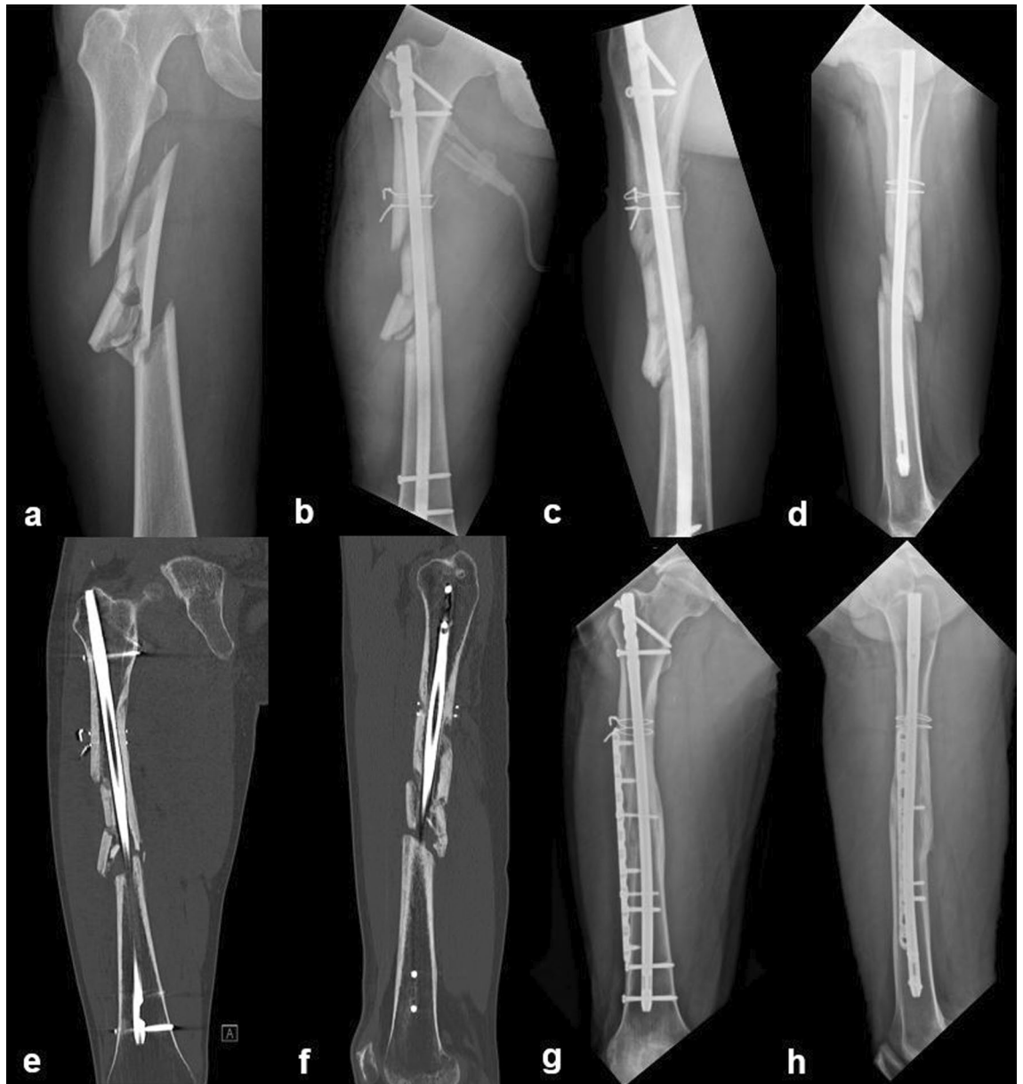
Figure 2. A 24-year-old male patient with a right femur segmental fracture caused by a motorcycle accident. (a) Plain radiograph at the initial visit. Segmental fracture was observed between the subtrochanteric area and the isthmus of the femur. (b) Fracture was treated with intramedullary nailing. Traction force was applied and cerclage wires were used for reduction. (c, d) Plain radiographs 9 months after surgery. Oligotrophic nonunion with little callus formation at distal isthmus area was observed. Second operation with plate augmentation was planned for nonunion. (e, f) Before the second operation, computed tomography (CT) was performed to confirm the location and extent of the nonunion. On CT coronal and sagittal planes, it is noted that there is no callus formation in the distal isthmus area. (g, h) Plain radiographs 46 months after second operation. Complete union was achieved.

(3–9 months). Insufficient filling of the IM nail was observed in 13 cases (34.2%), and a residual gap was found in 15 cases (39.5%) (Table 1).