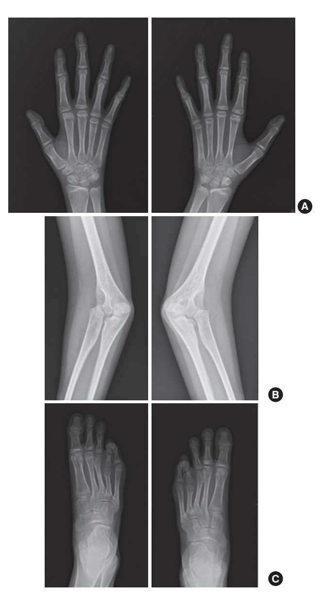
Fig. 1. Radiographs of the patient's hands, elbows, and feet. X-rays showing arachnodactyly of the hands (A), bilateral elbow dysplasia and subluxation of the proximal radioulnar joint (B), and bilateral shortening and clinodactyly of the fourth metatarsal bones (C).

with previous reports, this patient had a relatively weak phenotype with respect to impaired sexual development and steroidogenesis. We performed exome sequencing instead of targeted Sanger sequencing for the following reasons: (1) the patient had a mild phenotype; (2) the FGFR2 and POR genes contain a large number of exons, and conventional gene-by-gene sequencing would be more expensive and time-consuming than exome sequencing, and (3) exome sequencing would allow for the analysis of new ABS candidate genes.